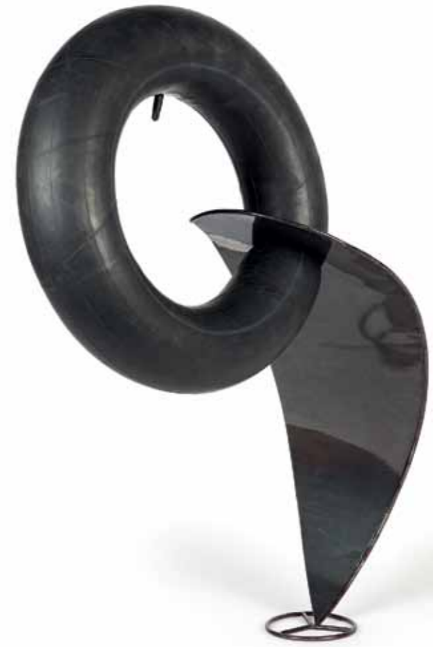
Mixed media | variable dimensions | 2016