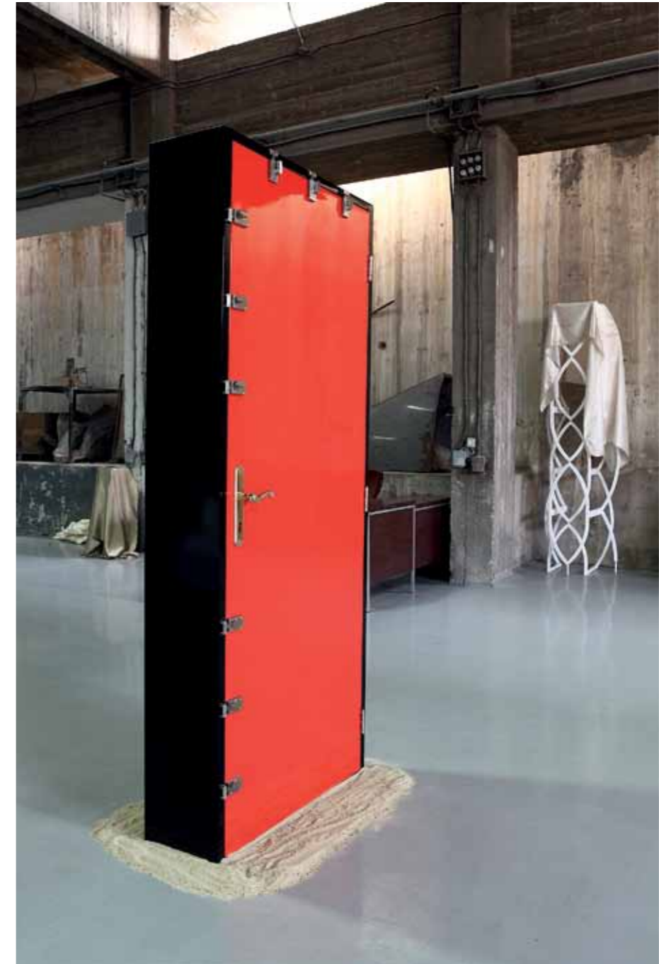
Gate of the Orient | mixed media | 216,5x88x29cm | 2010

Boespflug, François. Le Prophète de l'Islam en Images. Un Sujet Tabou? Paris: Bayard, 2013.