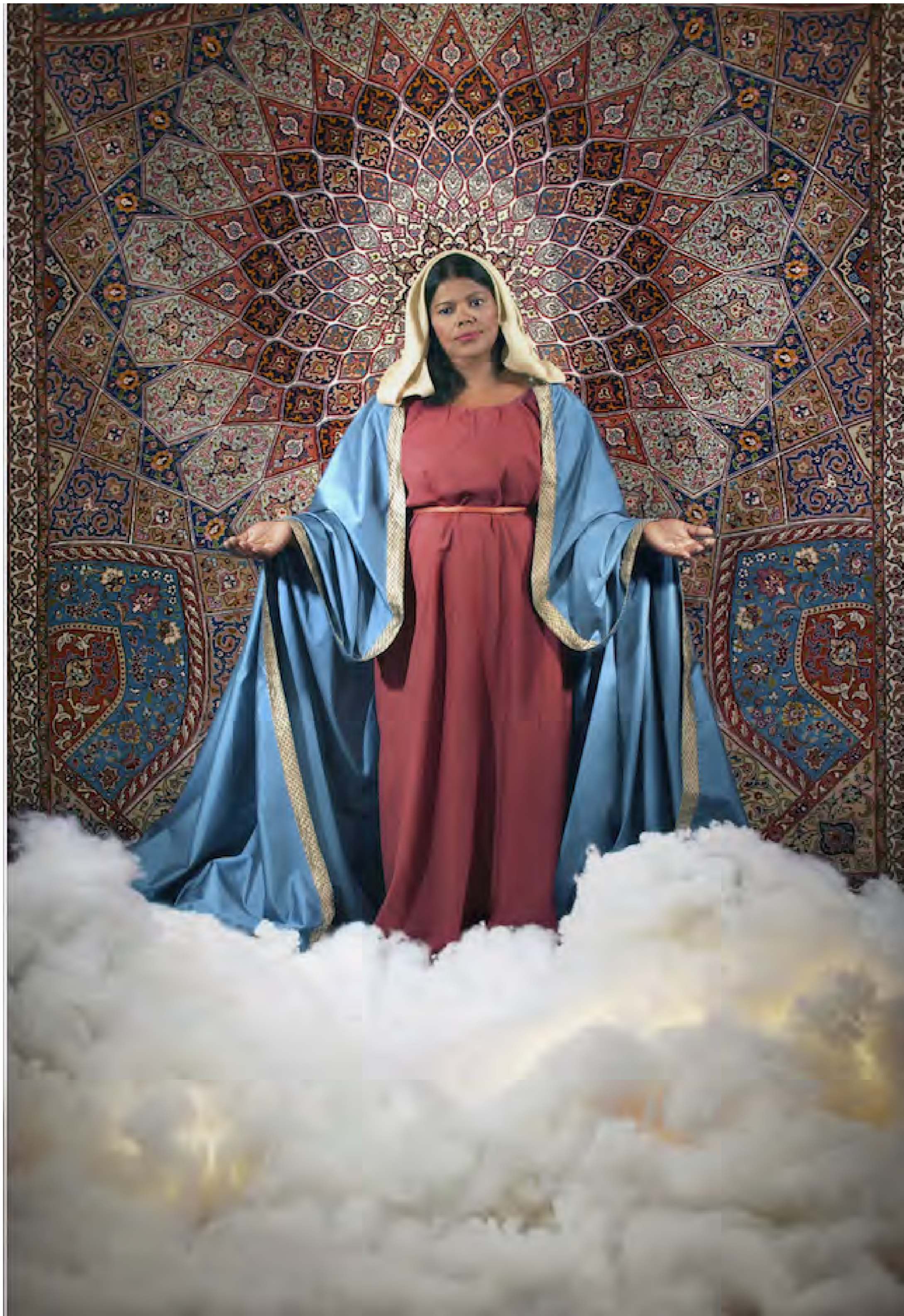
KuMaria, 80x55 cm