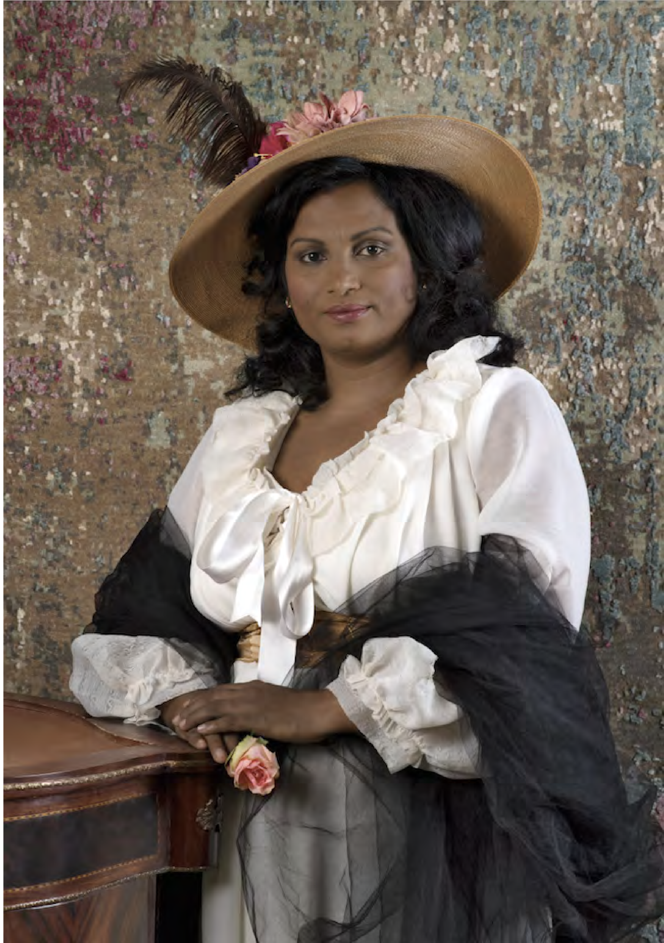
Nilou, 100x70 cm