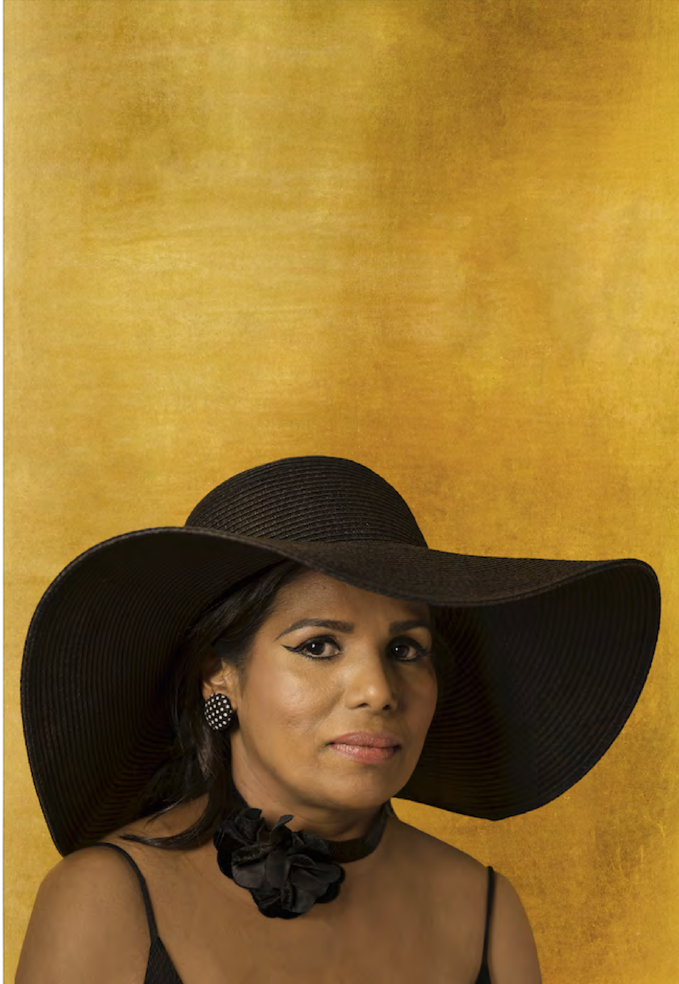
Ruby With Hat, 80x55 cm