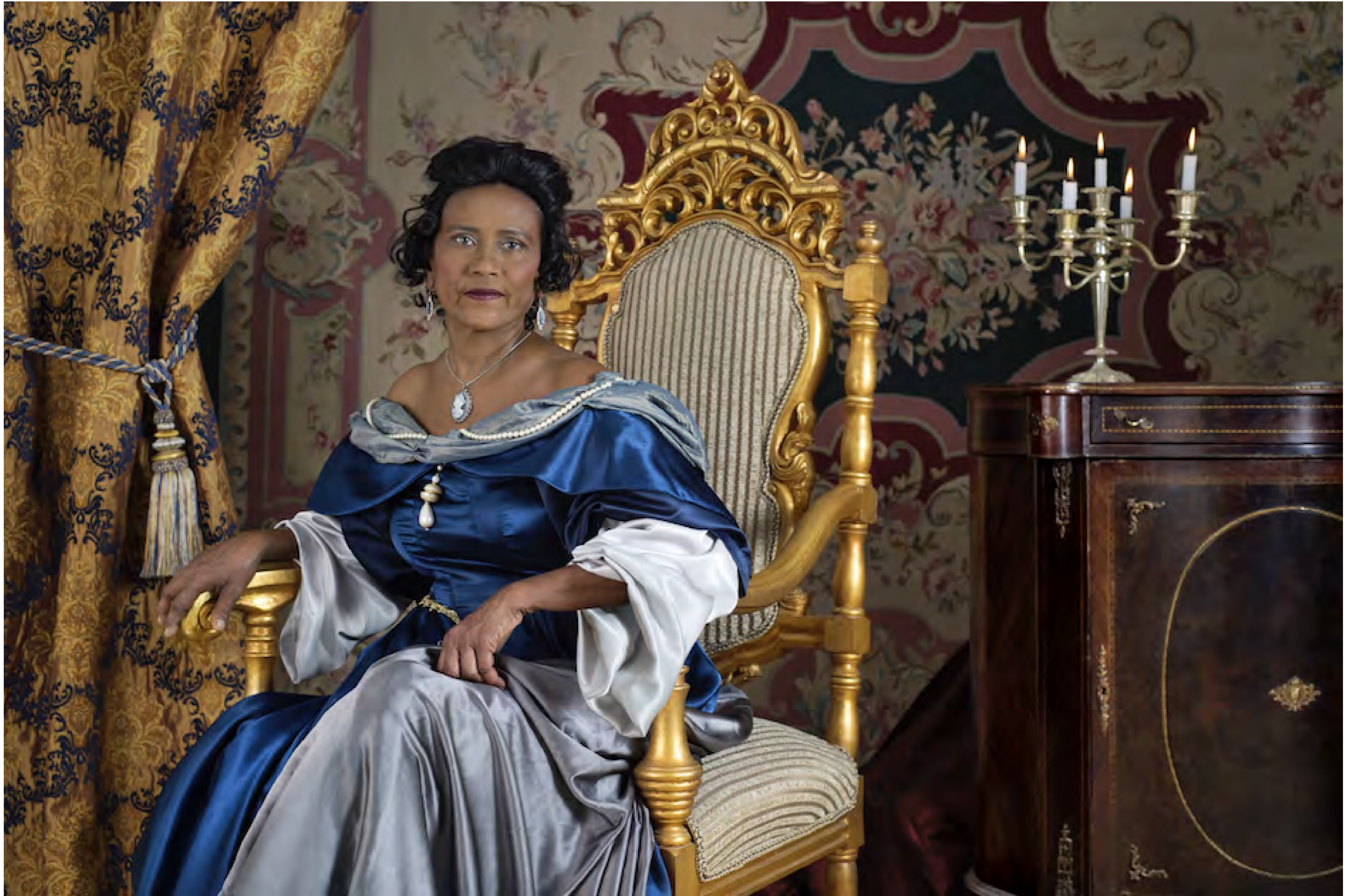
Melanie, 55x80 cm

All photographs are printed with archival ink on Hahnemühle Photo Rag® Pearl 320 gsm 100% Cotton, mounted on dibond and framed with UV Filter glass