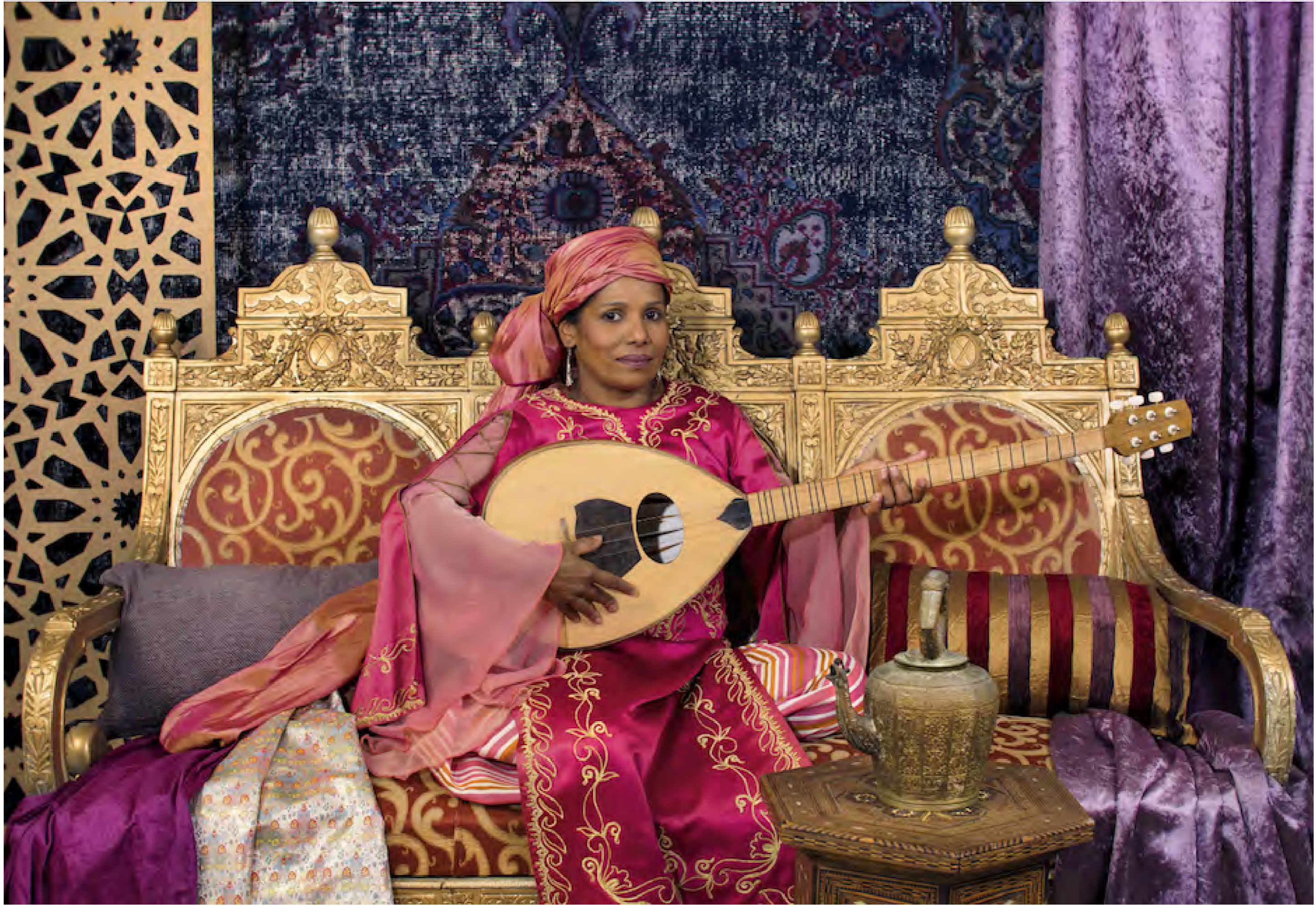
Ruby With Oud, 55x80 cm