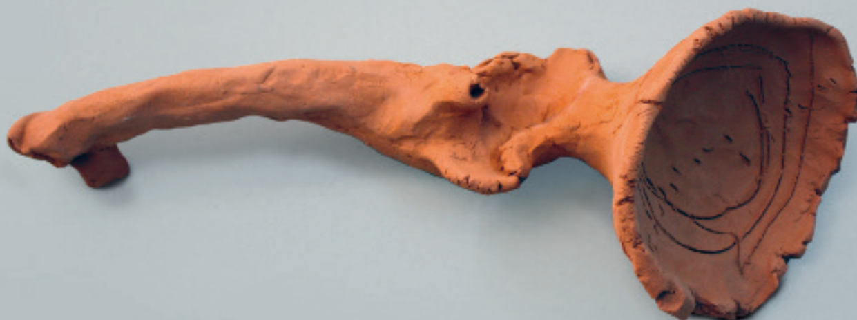
Bones , earthenware, fired clay, 36 x 10 x 13 cm, 2019

a fence to ward off danger and deepen warmth and nostalgia.