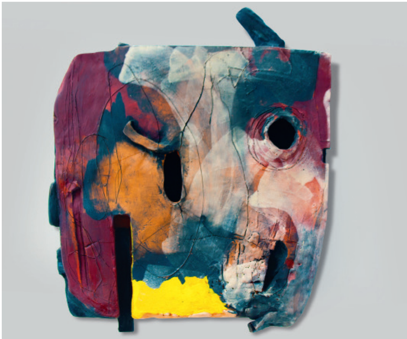
The Absences of Presence , earthenware, ceramic with slip, 47 x 41 x 6 cm, slabs, 2019

The artist Waleed R. Qaisi arouses an element of surprise with his ceramic work, overcoming the conventionalism of material. Art appreciation is the most important test here in facing the three-dimensional body of clay that has a twist in its aesthetic problematic presence, where the viewer needs different skills to sense the energy of prone forms on a shadow full of curves, where the clay material expands to own its abstract form through different understandings. Waleed is not only satisfied with the body of clay, but also adds threads and metal wires wrapping around the clay work that converts it into a strange mantra, illuminating and stimulating the viewer through modernist art and its accelerating