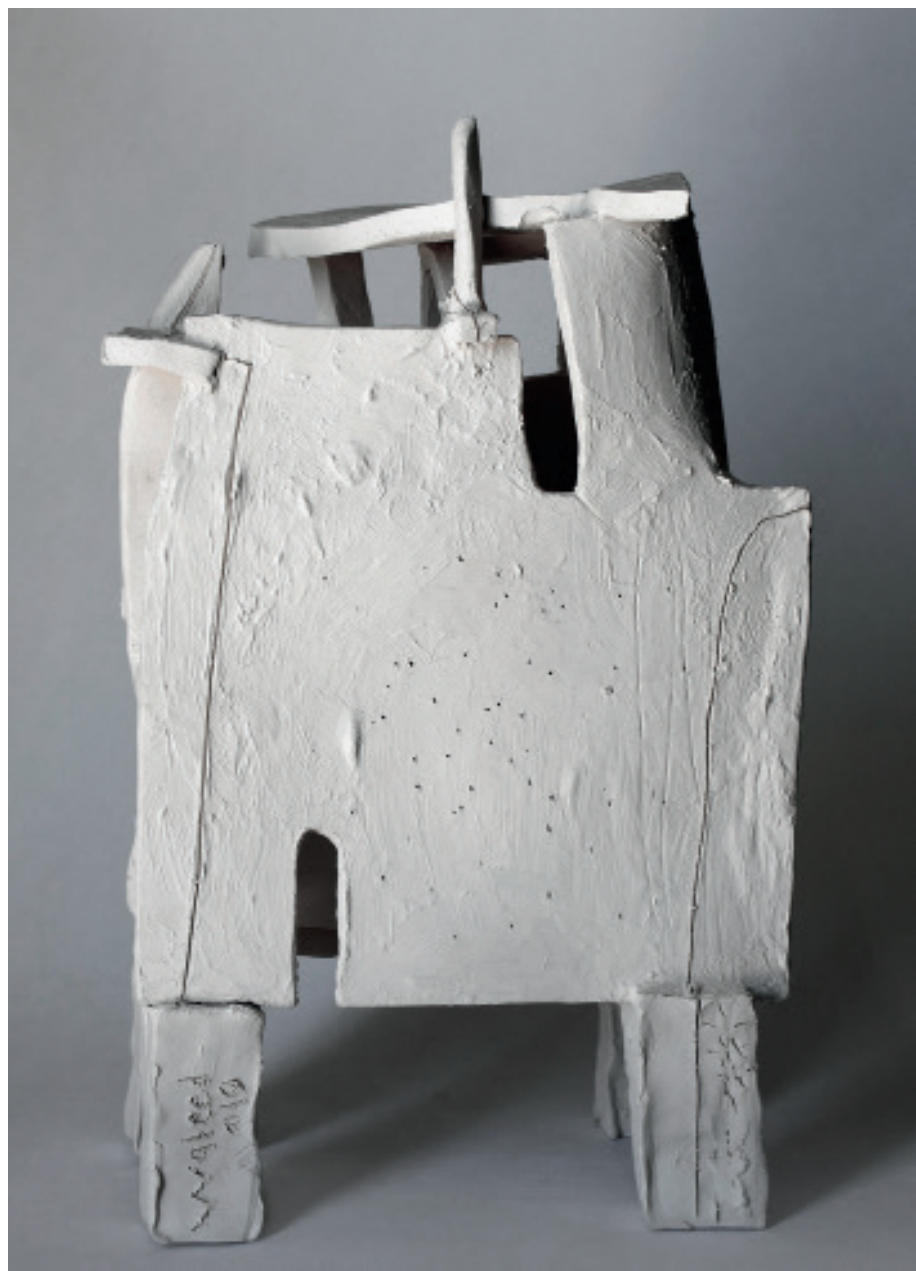
Untitled, ceramic, wood-fired, 35 x 40 x 60 cm, 2016